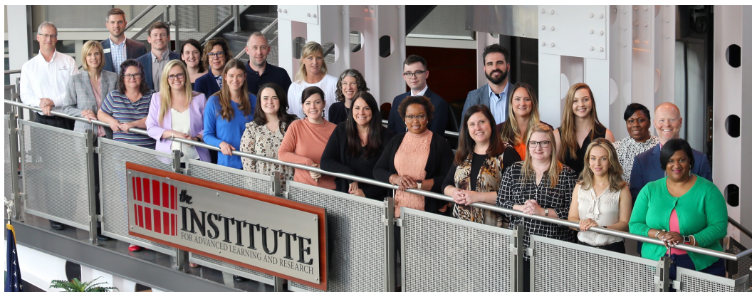
2022 VRLI Cohort, 26 of 29 Cohort Members

Each VRLI Cohort Member is paired with a mentor that advises them on advancing their career and impact in rural Virginia, as well as on the development of their Community Impact Project. These projects, which are designed by every cohort member produce a tangible impact after graduation in the cohort members' communities.