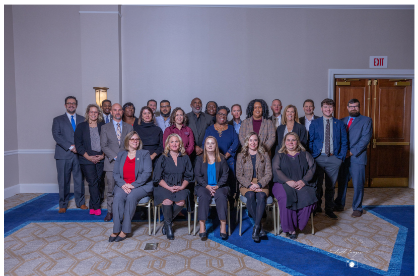
2023 VRLI Cohort, 24 of 28 Members

“Very valuable experience. Even though each region is unique, they all have similar issues and concerns. I saw some things from the presentations that I would like to try in my part of Rural Virginia.” -2023 Cohort Member